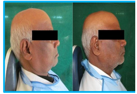
Fig. 11: Pre- and post- treatment extra-oral profile comparison

fabricated using Type III Gypsum product (VIP). Maxillary and mandibular rims were constructed. During jaw relation procedure, placement of the mandibular rim displayed remarkable prognathism of the mandibular lip in comparison to the maxillary lip (Fig. 3 & Fig. 4). This soft tissue discrepancy was corrected by a simplified, yet an innovative technique by the use of modelling wax in the anterior segment. Modelling wax (MAARC) was softened and layered over the vaseline applied surface of the maxillary fixed partial denture and remaining natural teeth. Mandibular occlusal rim was placed and patients' profile was evaluated. This wax-layering approach was repeated until satisfactory extraoral appearance was finalized. After establishing acceptable extra-oral profile, a 19 gauge stainless steel labial bow was fabricated on the cast and the labial wax was transferred and incorporated in the anterior portion of the bow. The bow was in contact with the buccal surface of the posterior occlusal rim and attached distally with sticky wax (MAARC) to the denture base. This assembly (labial bow, labial wax, denture base and posterior occlusal rim) was placed intra-orally (Fig. 5, Fig. 6 & Fig. 7) and patients' profile and extra-oral appearance were re-examined. The patients' satisfaction was confirmed. The labial wax was then made 2 mm short of the vestibular depth to provide room for the border moulding