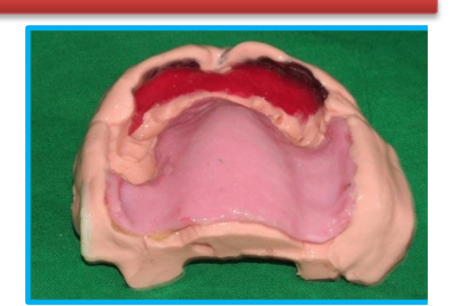
Fig. 10: Set impression included the assembly and border moulded material

fabricated using Type III Gypsum product (VIP). Maxillary and mandibular rims were constructed. During jaw relation procedure, placement of the mandibular rim displayed remarkable prognathism of the mandibular lip in comparison to the maxillary lip (Fig. 3 & Fig. 4). This soft tissue discrepancy was corrected by a simplified, yet an innovative technique by the use of modelling wax in the anterior segment. Modelling wax (MAARC) was softened and layered over the vaseline applied surface of the maxillary fixed partial denture and remaining natural teeth. Mandibular occlusal rim was placed and patients' profile was evaluated. This wax-layering approach was repeated until satisfactory extraoral appearance was finalized. After establishing acceptable extra-oral profile, a 19 gauge stainless steel labial bow was fabricated on the cast and the labial wax was transferred and incorporated in the anterior portion of the bow. The bow was in contact with the buccal surface of the posterior occlusal rim and attached distally with sticky wax (MAARC) to the denture base. This assembly (labial bow, labial wax, denture base and posterior occlusal rim) was placed intra-orally (Fig. 5, Fig. 6 & Fig. 7) and patients' profile and extra-oral appearance were re-examined. The patients' satisfaction was confirmed. The labial wax was then made 2 mm short of the vestibular depth to provide room for the border moulding