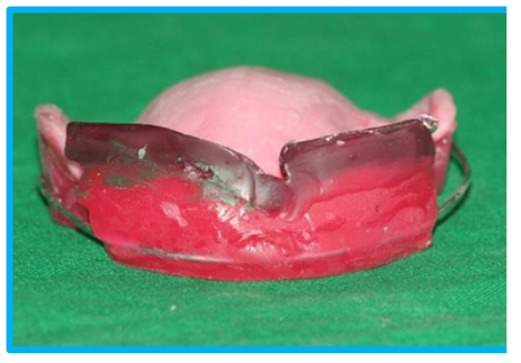
Fig. 8: Placement of mouth temperature wax at the borders

maxillary fixed partial denture supported by the right central incisor, left lateral incisor, left canine and left first molar. The remaining natural teeth and abutments had poor prognosis due to mobility and positive percussion test (Fig. 1). Treatment plan framed was maxillary immediate and mandibular conventional complete dentures respectively. Preliminary impressions were made followed by maxillary pick-up impression (Fig. 2) and mandibular definitive impression. Casts wer