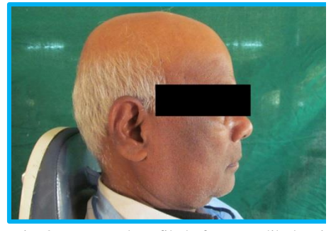
Fig. 3: Extra-oral profile before mandibular rim placement Fig. 4: Extra-oral profile after mandibular rim placement