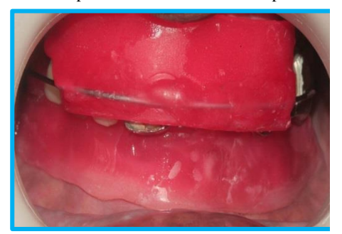
Fig. 6: Intra-oral placement of assembly-frontal view